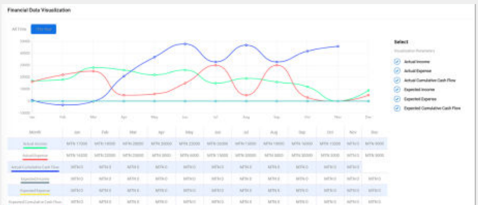
Screenshot of the web-dashboard displaying a financial comparison between expected and actual income & expenses and cumulative cash flow for an example water scheme.

The Web-Dashboard enables a two-way data interaction with the app. It aims to serve as an online visual dashboard for insights on maintenance performance and/or as a planning or financial tracking tool for stakeholders on a decision-making level.